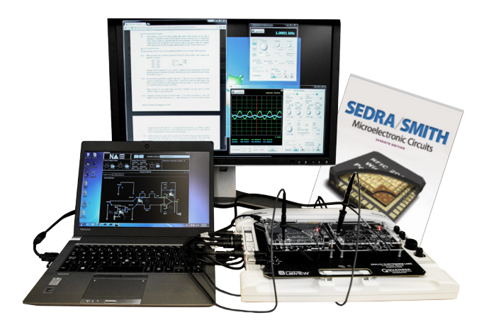
System specifications on reverse page

Conventional breadboard labs can only do so much, and stop far short of applications of any meaningful complexity. Designed with guidance from renowned author Dr. Adel Sedra, Analog Electronics Labs (AELabs) is an easy to deploy, PCB-based lab platform that takes your students from a single op amp on a breadboard to systems and real applications. Introduce your students to the excitement of analog design and extend the use of your NI ELVIS II+ platform!