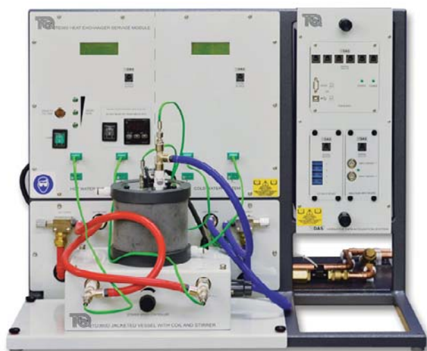
SHOWN FITTED WITH ONE OF THE OPTIONAL HEAT EXCHANGER MODULES AND OPTIONAL VDAS-F INTERFACE

You can do tests with or without a computer connected. However, for quicker tests with easier recording of results, TecQuipment can supply the optional Versatile Data Acquisition System (VDAS®). This gives accurate real-time data capture, monitoring and display, calculation and charting of all the important readings on a computer (computer not included).