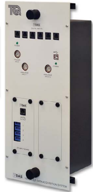
VERSATILE DATA ACQUISITION SYSTEM FRAME-MOUNTING INTERFACE (VDAS-F MKII)